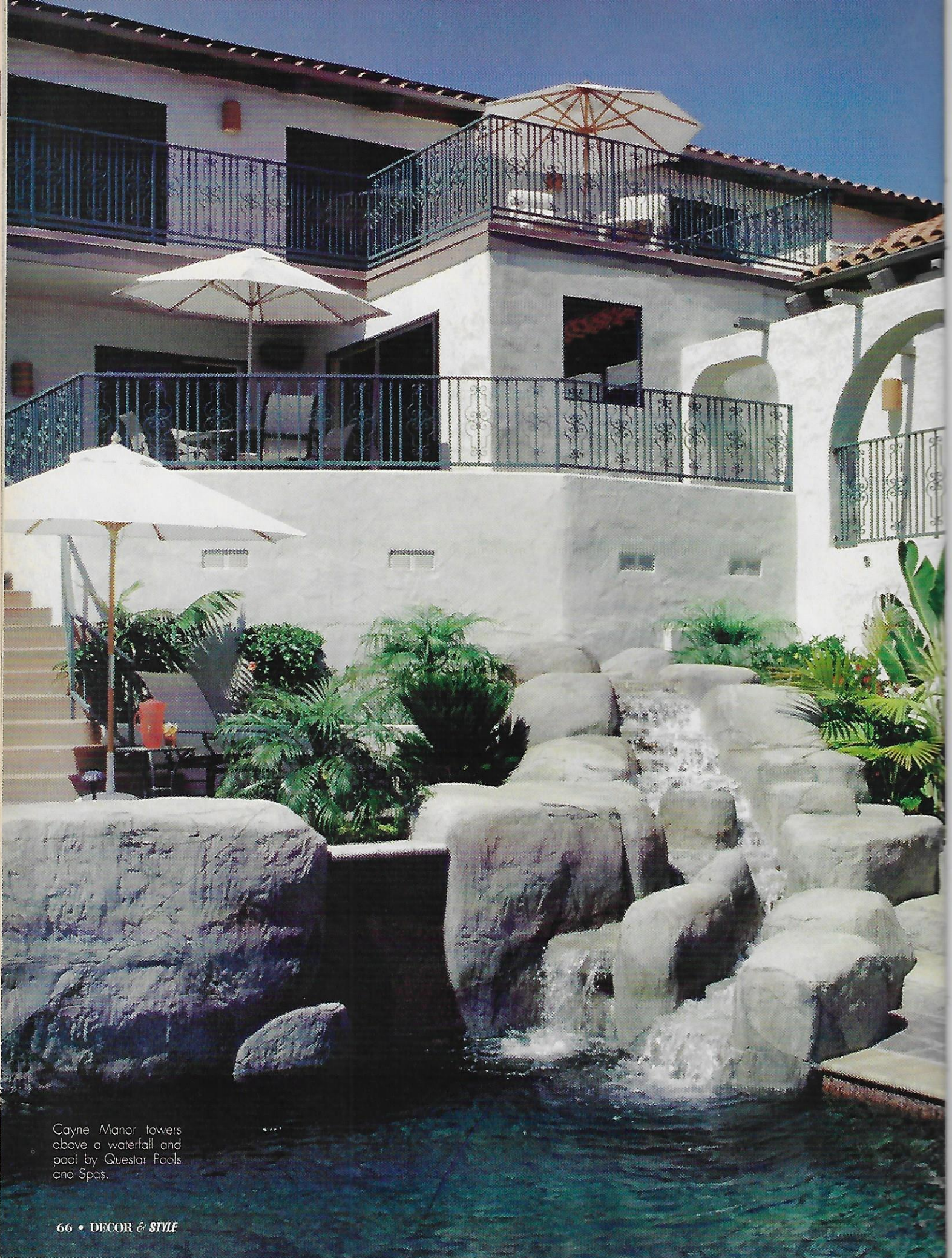
Cayne Manor towers above a waterfall and pool by Questar Pools and Spas.